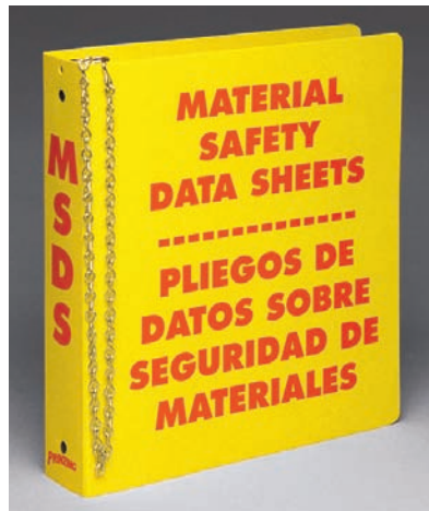
Bilingual Standard MSDS Binder