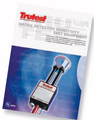
Trutest - Sensitivity Test Equipment